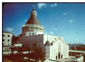
Nazareth - Basilica of the Annunciation

We drive through the Jordan Valley to Jericho to view the Mount of Temptation and the ruins of Old Jericho. Then to the baptismal site on the River Jordan where we will renew our baptismal vows. After stopping at the Dead Sea for a dip in its salty waters, we continue up to Bethany to visit the church built on the traditional site of the house of Mary and Martha and their brother Lazarus. Then to Jerusalem for overnight. (B,D)