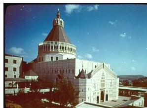
Nazareth - Basilica of the Annunciation

We drive through the Jordan Valley to Jericho to view the Mount of Temptation and the ruins of Old Jericho. Then to the baptismal site on the River Jordan where we will renew our baptismal vows. After stopping at the Dead Sea for a dip in its salty waters, we continue up to Bethany to visit the church built on the traditional site of the house of Mary and Martha and their brother Lazarus. Then to Jerusalem for overnight. (B,L,D)